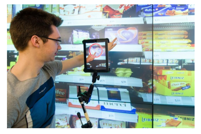
Figure 1: AR interface of ProFi.

According to visual search theories, visual attention is limited to a specific location with a predefined size ("spotlight metaphor") [3]. Spatial cueing theory assumes that objects within this spotlight are processed faster than objects outside this spotlight [8]. Spatial cues facilitate the detection and response to objects presented at the cued location. Accordingly, by providing visual patterns or cues about the specific position of the product on the shelf, users' product search performance will be enhanced in terms of search effectiveness and efficiency.