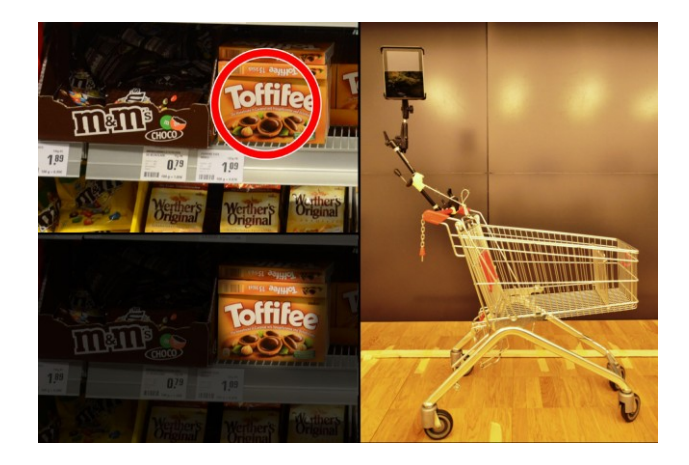
Figure 2: Left: Circle (upper image) and spotlight (lower image) patterns are used to highlight target products in the AR interface. Right: Our prototype configuration.

We mount a mobile device on a shopping trolley, pointing the back-facing camera towards the shelf (see Figure 2 Right). While a user is walking and browsing products, the mobile device extracts features from the